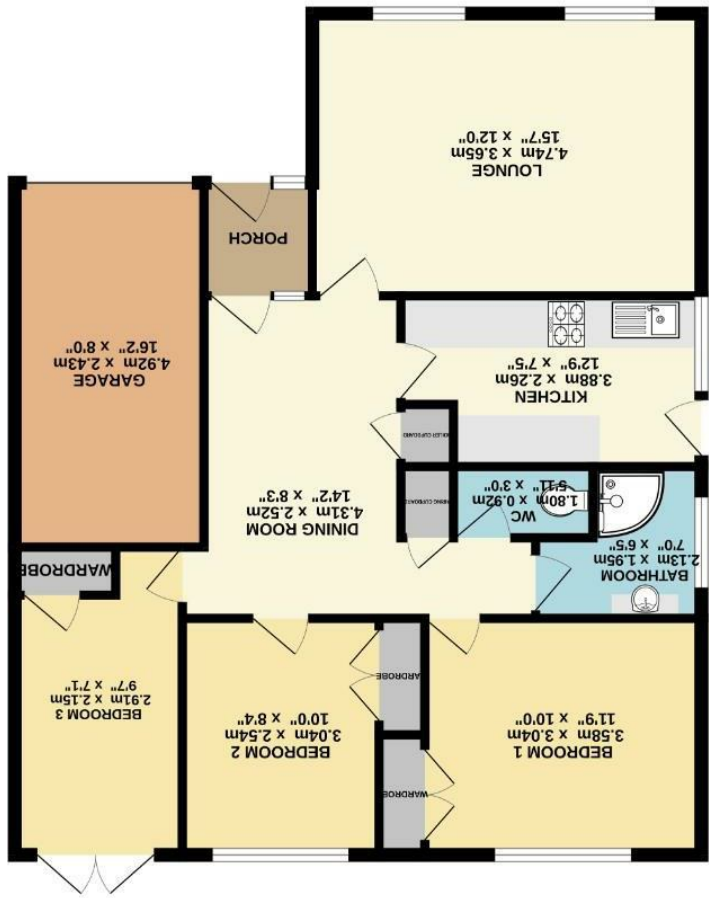
GROUND FLOOR 87.8 sq.m. (945 sq.ft.) approx.

Whilst every attempt has been made to ensure the accuracy of the floorplan contained herein, measurements of doors, windows, corners and any other items are approximate and no responsibility is taken for any error, omissions or misstatements. This plan is for illustrative purposes only and should be used as such for any prospective purchaser. The services, systems and appliances shown have not been tested and no guarantee is given as to their operability or efficiency and no guarantee is given.